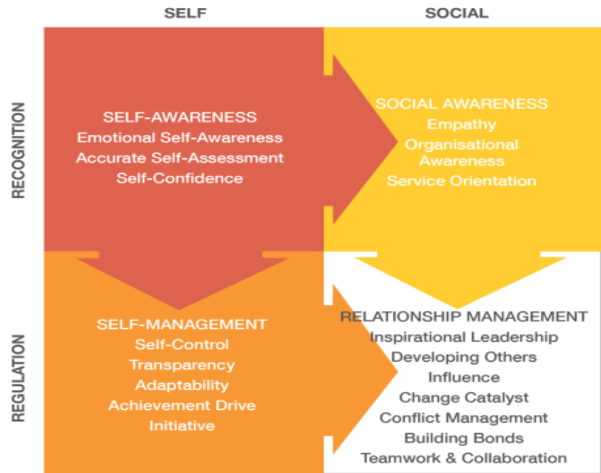
Goleman's Emotional Intelligence Model (2002)